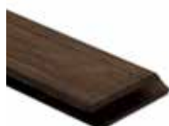
Closed profile 65 mm