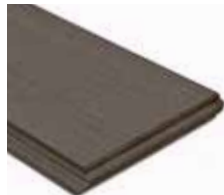
Closed profile - Vintage 137 mm